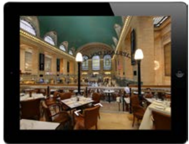
Tour business interiors with Google Business Photos on desktop, mobile, and tablet devices